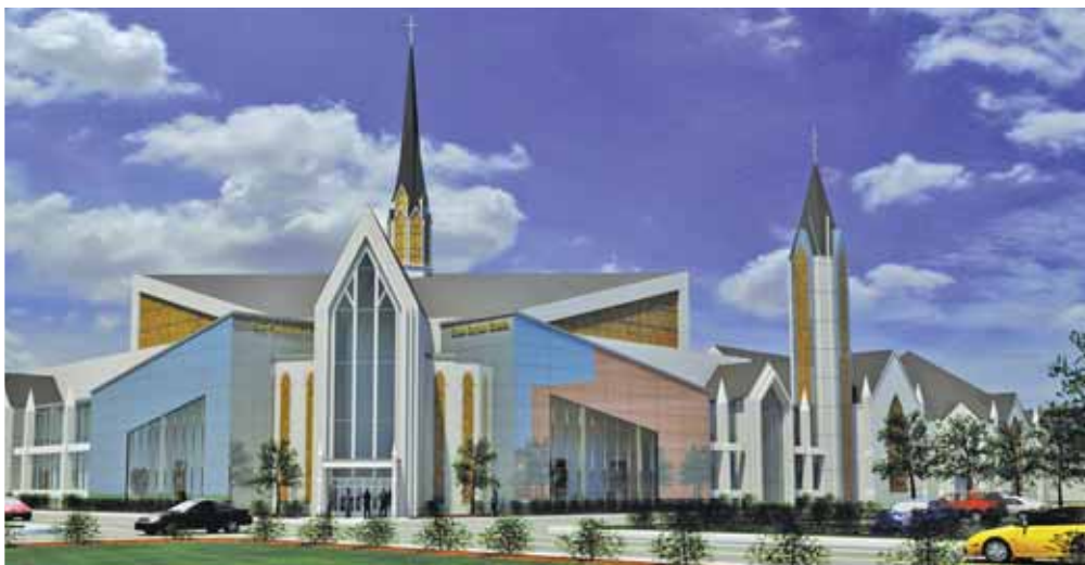
The interior and exterior renderings of the new Grace cathedral.

All the glory, all the honor, all the praise, belongs to God!