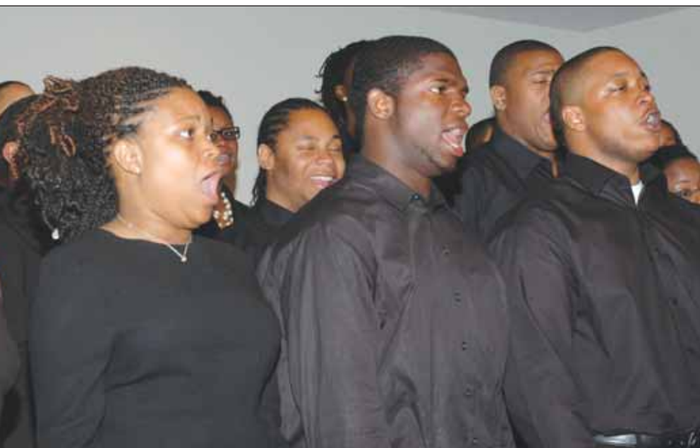
Young adults at Grace singing to the glory of God.

The Young Adult Ministry at Grace Baptist Church is not a new ministry. It was inactive for a short time, but in 2004 efforts were made to rejuvenate the ministry. Following the guiding principle of Proverbs 3:5-6, the Young Adult Ministry challenges its members at a time when many are making important decisions that will impact the rest of their lives to put complete trust in God and acknowledge His presence every step of the way. The Young Adult Ministry strives to positively impact the lives of 18- to 35-year-olds in the church through Bible study, prayer, and by being a support network of peers both within the church and among other young adult ministries in the area. In doing this, the ministry of Grace Baptist Church